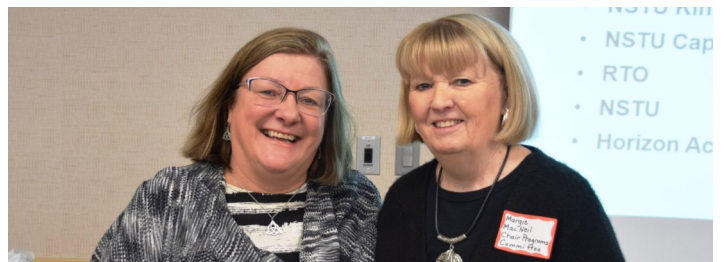
Invited speaker at NS Retired Teachers Symposium.