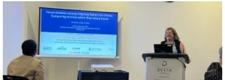
Presenting research results from Home Care Pathways project at the Canadian Association of Health Services and Policy Research conference.