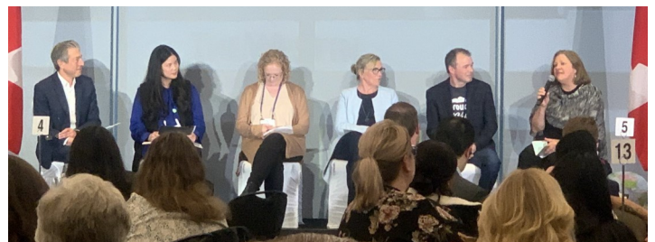
Panelist at the 2024 RIA Walk with Me Conference: Changing the culture of aging in Canada.