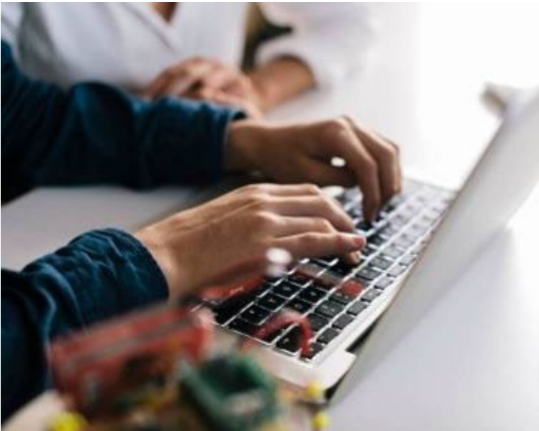
Figure out you

Pause, get reflective, and use the following tools to discover who you are and what you'd like to do.